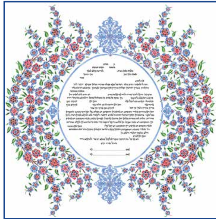
“Dreamcatcher” is composed of delicate floral “Hamsas” symbolizing the divine potential of a loving marriage and blessings of protection from harm - by Amy Fagin.