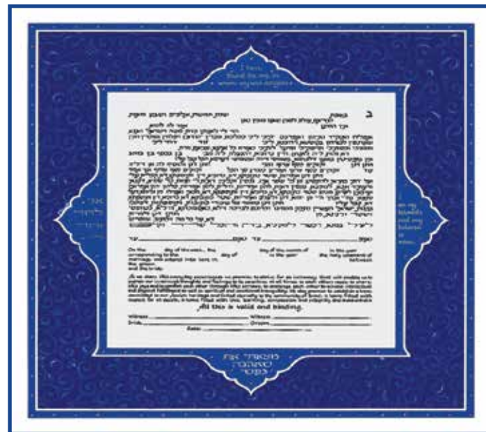
“Persian Silk” ketubah, a delicate light blue filigree on a dark blue background mimics shimmering Persian silk - by Mickie Caspi.