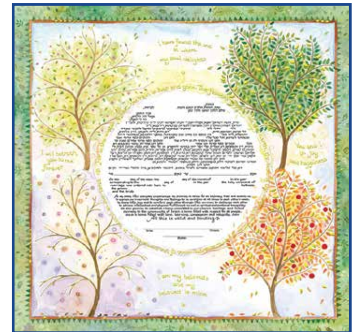
“Four Trees” is a celebration of the marriage vows today and the promise of a future together represented by the seasons to come - by Mickie Caspi.