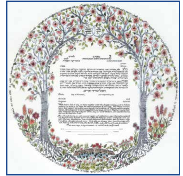
“Woodland Canopy” ketubah, a pairing of strength, and an image of two family trees uniting - by Betsy Platkin Teutsch.