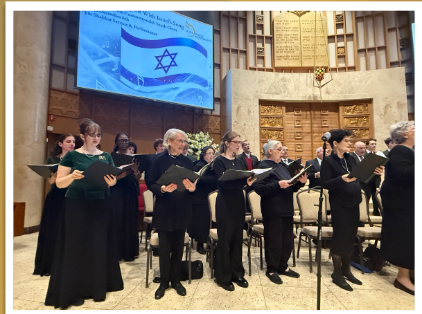
Judas Maccabaeus by: George Frideric Handel